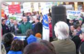
State House Rally Feb. 22

Uprisings and resistance in Egypt, Tunisia, Yemen, Algeria, and Libya, are echoing in Wisconsin, Ohio, North Carolina and Virginia. What is needed is what Dr. Martin Luther King, Jr. called for, structural political and economic changes.